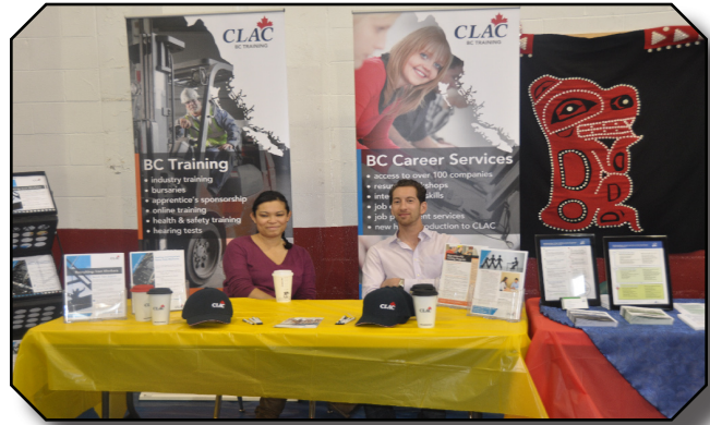
ACCESS COMMUNITY FORUM MAY 31, 2012

The theme of the spring forum was Youth Futures. The Forum was an incredible success with 340 community members and exhibitors attending. Guest speakers included members of the film industry from IATSE Local 891 and Stunts Canada.