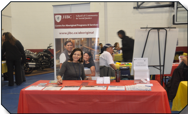
Informational booths provide clients an opportunity to gain valuable information about careers

ACCESS would like to extend our sincere thanks to everyone who supported our Community Forum.