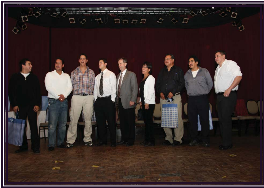
The Honorable Minister George Abbott, centre, attended the dinner to honour the Red Seal participants

On November 19, 2009, ACCESS Trades hosted a dinner for fifteen Red Seal graduates who have successfully completed their Red Seal Certification. The event included family members, friends, dignitaries and community members from Aboriginal organizations and educational and training institutions across the Lower Mainland.