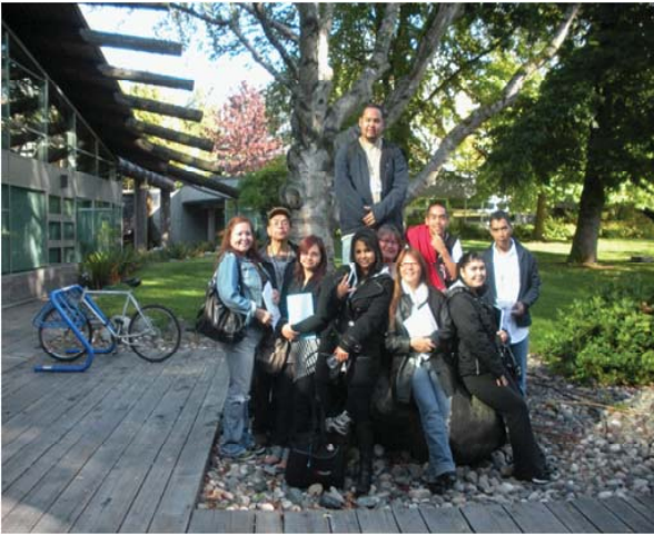
Essential Skills for Aboriginal Futures Call Centre participants.

Essential skills are the skills that are needed for work, learning and everyday life. They provide the foundation to learn a multitude of skills that enable learners to evolve and adapt to changes within the workplace.