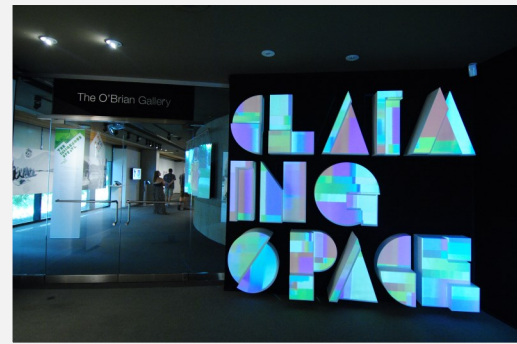
Claiming Space: Voices of Aboriginal Youth