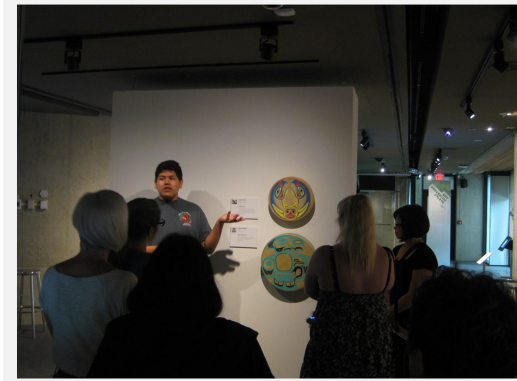
Students provide cultural tours and information to visitors of the MOA

The Claiming Space exhibition continues at MOA until January 4, 2015.