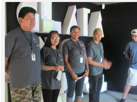
MOA's Native Youth Program interns share their own experiences and research with the general public through tours of the temporary exhibition Claiming Space