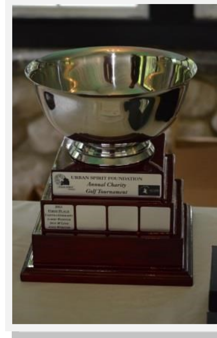
USF Annual Charity Golf Tournament Team Trophy. Each year the winning team will have their names added

USF held its 2nd Annual Urban Aboriginal Charity Golf Tournament at Country Meadows Golf Club on June 27, 2014. The tournament featured 18 holes of golf, shot gun start, a silent auction with plenty of on course games, prize draws followed by dinner and awards.