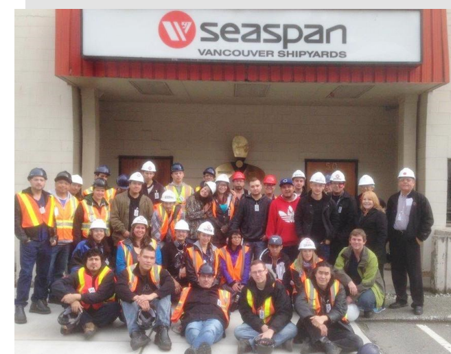
Welding and Metal Fabrication students on a site tour at Seaspan